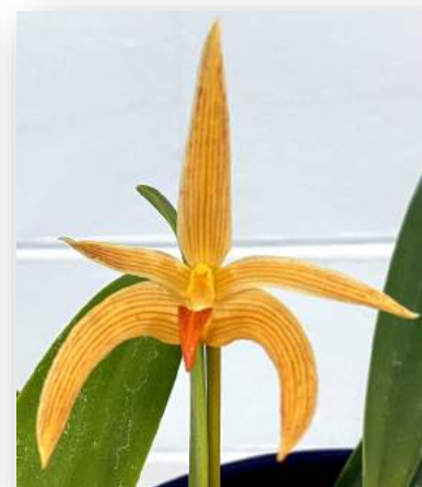
Bulbo. longissimum x lobbii