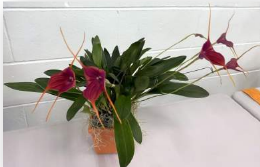
Masd. Blazing Wing Beenak