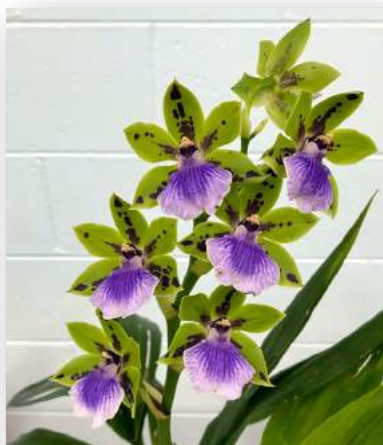
Zga. Adelaide Meadows