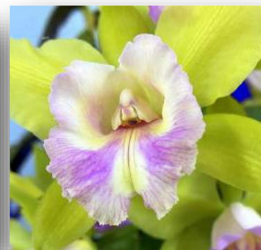
Rlc. Hawaiian Passion 'Kermie'