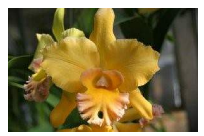
Our Club Emblem

<u>https://staugorchidsociety.org/</u> Check out this site belonging to the Saint Augustine Orchid Society in North Florida. Much of the information is relevant to us as the climate is fairly close to ours. There are articles to keep you busy for hours and cultural notes to help you out whether you are a beginner or a long time grower.