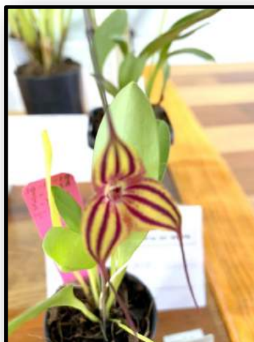
Masd. Funky "Black Bart"