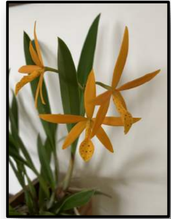
Pcv. Golden Peacock