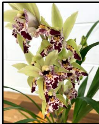
Cym. Butterfly Kisses "Viridian"