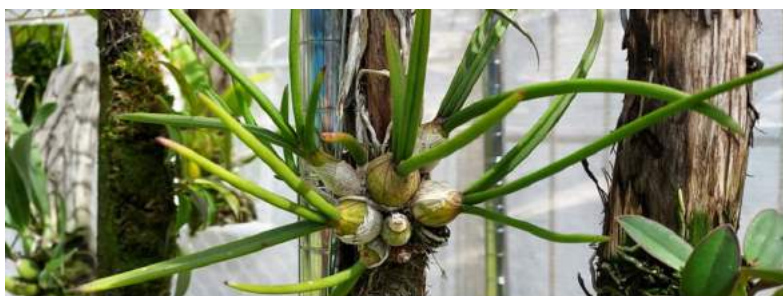
Mounted Orchid Cultivation and other Epiphytes

Mounted Orchid Cultivation and other Epiphytes. (Mounted Orchid Cultivation and other Epiphytes | Facebook)