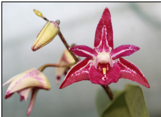
Photo3 Den. Ann's Rainbow Surprise Leaves a bit damaged from the fires but new growth is fine.

Photo2 Cym Choc Mint One of my favourite Cymbidiums